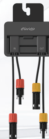
Thermal Plus / 1 For 2