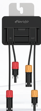
Basic / 1 For 1